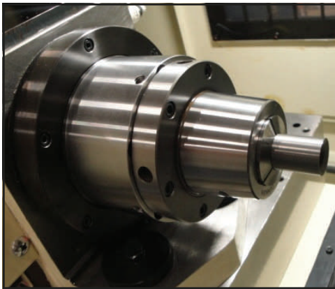
5C collet chuck assembly, pneumatically operated drawbar

Major manufacturer of carbide components selects the Weldon UGC with dual spindle capability for a challenging grinding application. This project involves OD, ID, and profile grinding on a wide variety of small carbide dies, seals, and other carbide parts. With this machine configuration multiple operations or rough and finish grinding can be accomplished in a single set-up. The system features a Dunham power operated collet chuck, GMN high-frequency grinding spindles, Spindel variable speed drives, Turmoil spindle chiller, Vogel spindle lubrication, and Sopko ID collet quills.