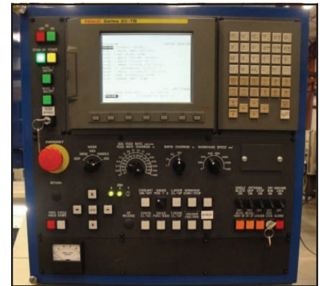
Operator control panel featuring a Fanuc 21i CNC control

Weldon Solutions offers a full line of CNC OD, ID, and combination grinders. As a Fanuc Robotics integrator Weldon can also address your machine tending, material removal, material handling, and packaging/palletizing needs.